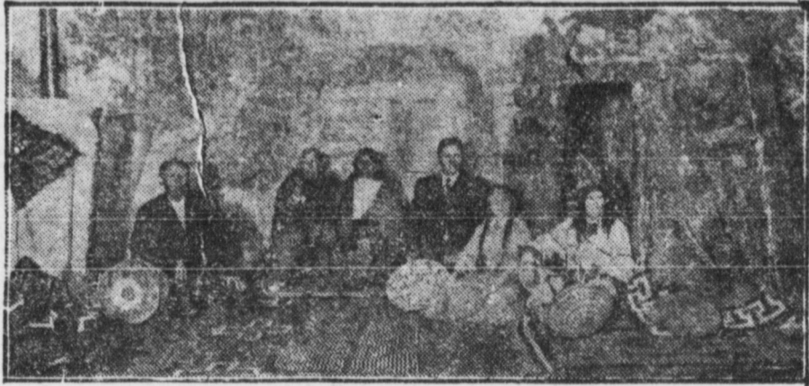
KIOWA INDIANS AND NAVAJO VILLAGE SCENE, "WORLD IN CINCINNATI."